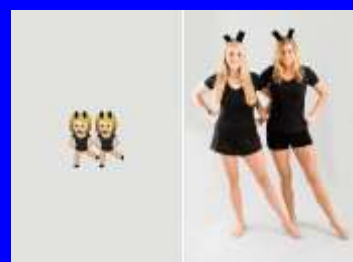
Dancing Girl Emoji