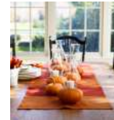
Hold Your Fire

For a no-fuss fall centerpiece, place sugar pumpkins in a rustic bowl. Attach double-stick tape to lengths of black, orange, and white patterned ribbon, then wrap around each squash.