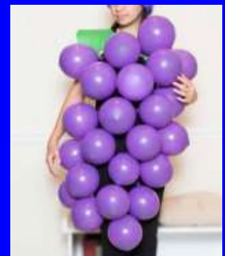
Bunch of Grapes